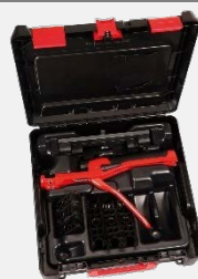
Ref. 250302 Bender copper 12 to 22 mm In Virabox case