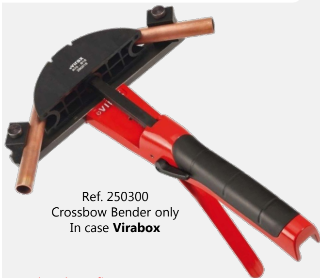
Ref. 250300 Crossbow Bender only In case Virabox

Ref: 250300 – 250301 – 250302 – 250303 - 250304 – 250305